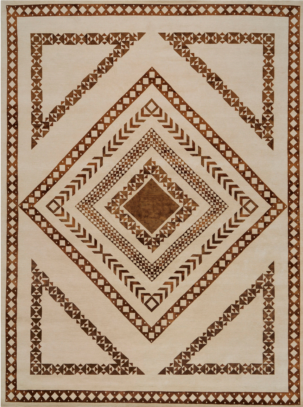
9' X 12' RUG SHOWN

COLOR: GOLD FIBER: WOOL & SILK GROUP# 517