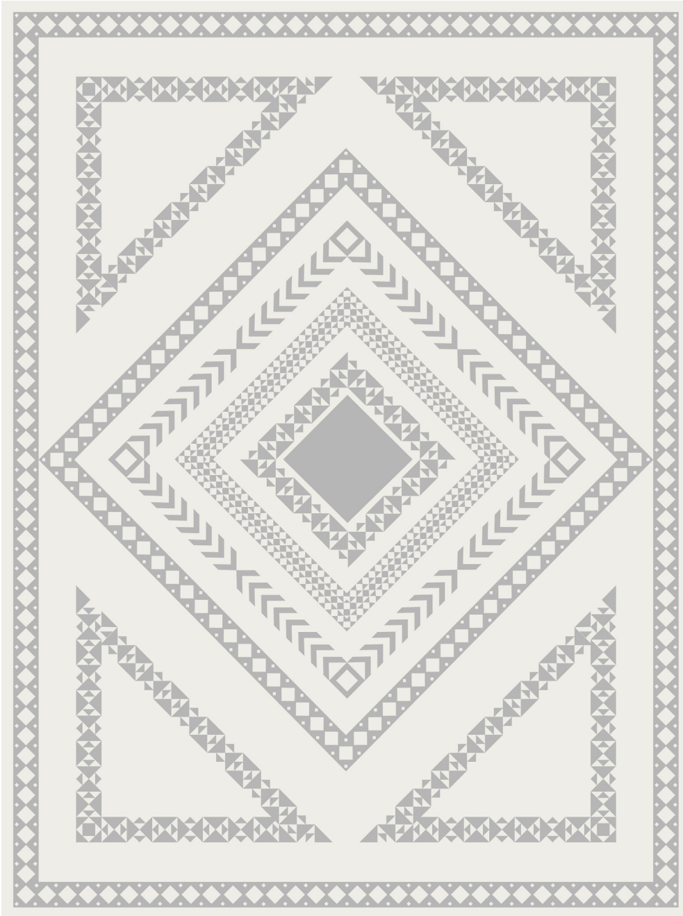
ARTWORK FOR 9' X 12' RUG SHOWN

COLOR: MERCURY FIBER: WOOL & SILK GROUP# 517