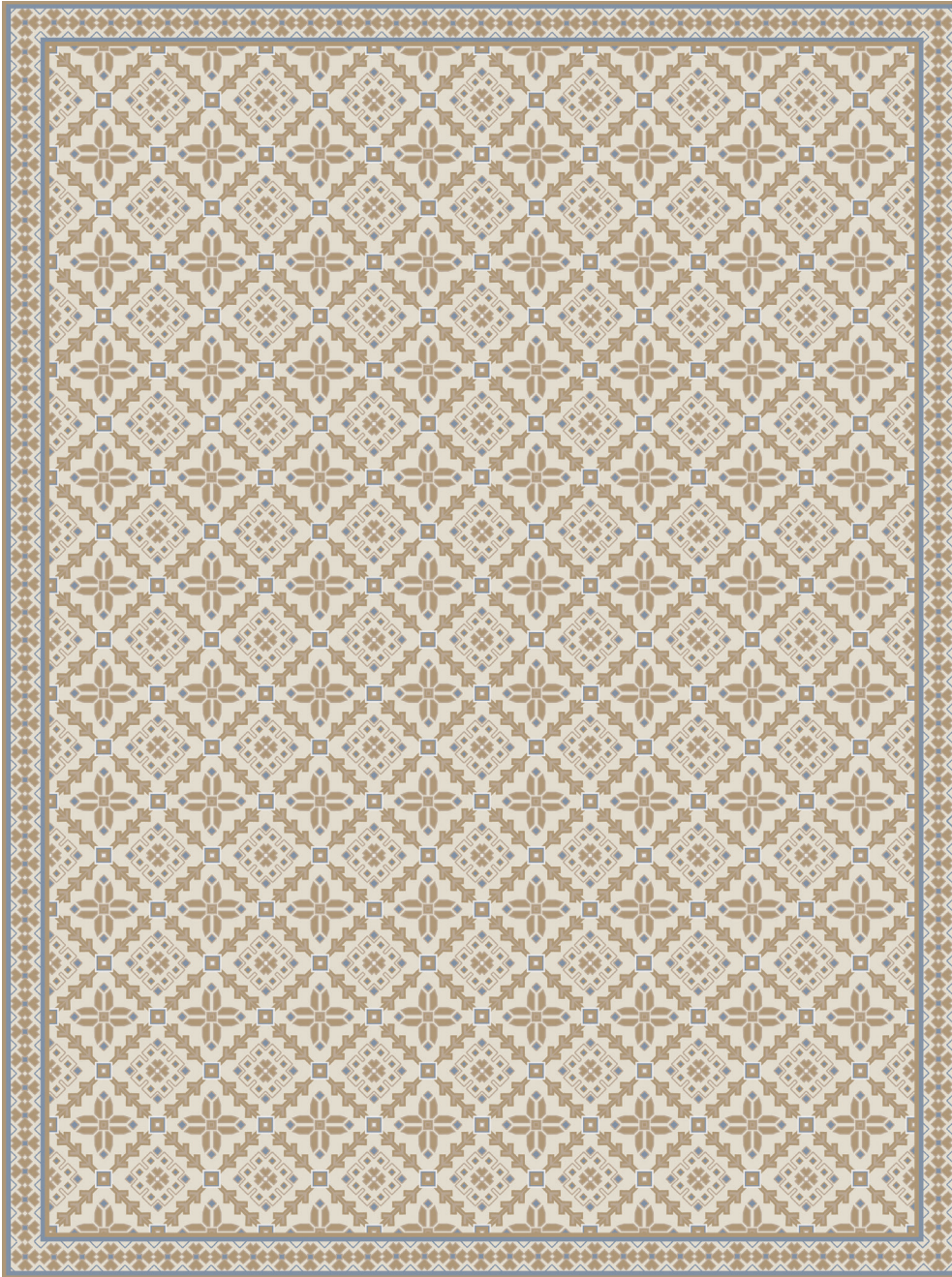
ARTWORK FOR 9' X 12' RUG SHOWN