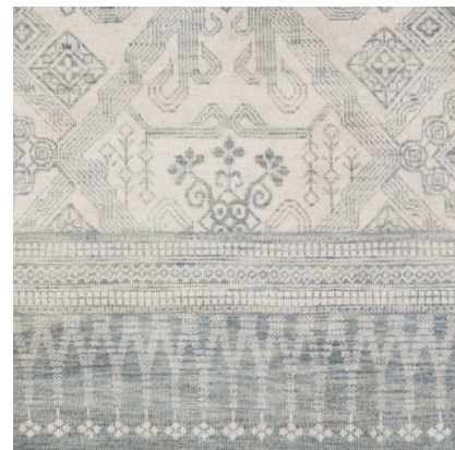
2' X 2' SAMPLE SHOWN