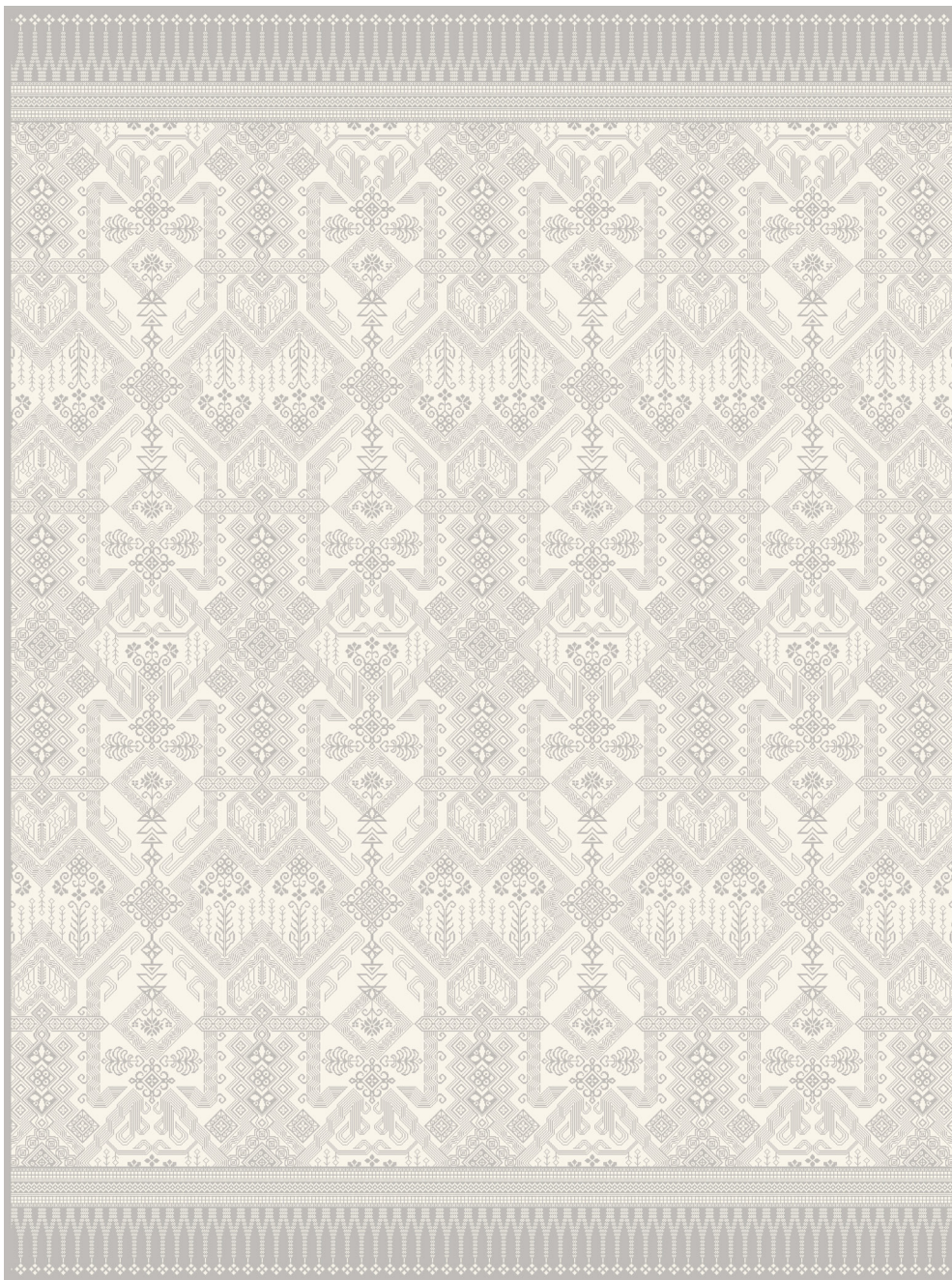
ARTWORK FOR 9' X 12' RUG SHOWN

COLOR: MORNING FOG FIBER: SILK & WOOL GROUP# 1189