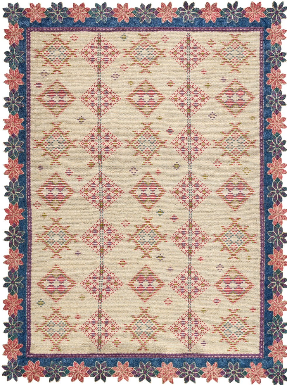
9' X 12' RUG SHOWN

COLOR: GARDEN MULTI FIBER: ABACA GROUP# 900