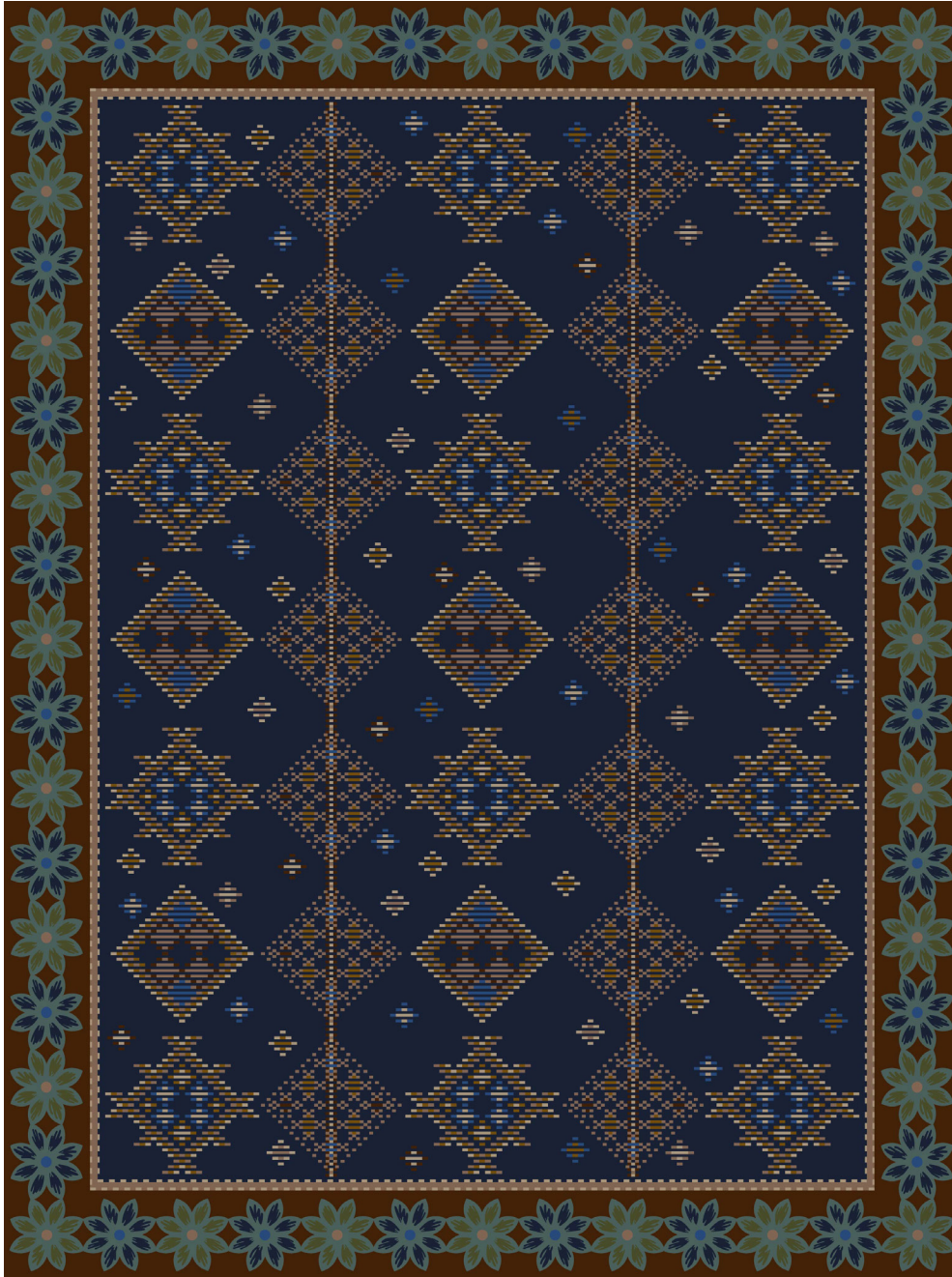
9' X 12' ARTWORK SHOWN