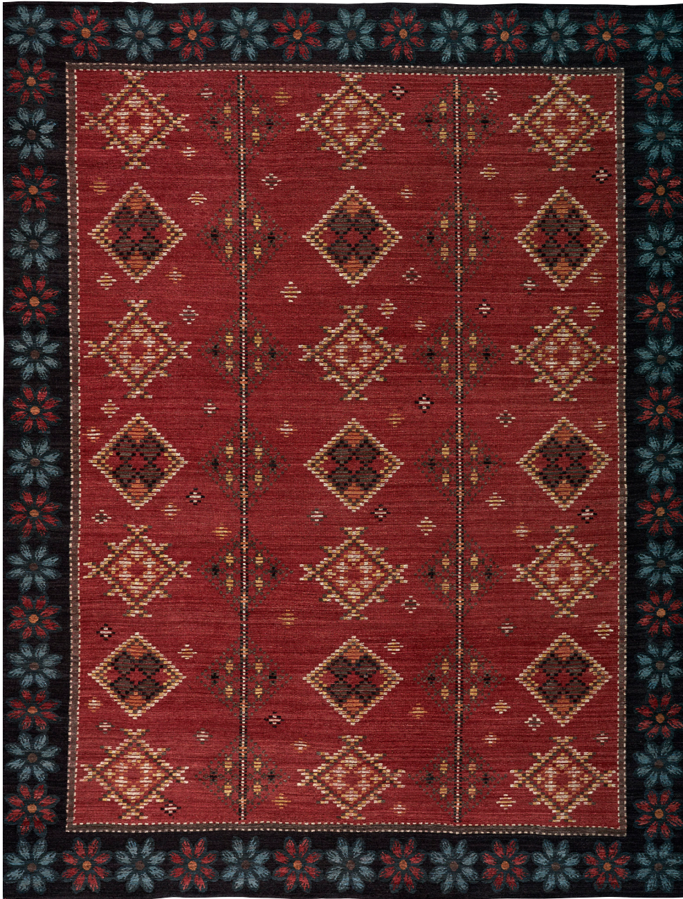
9' X 12' RUG SHOWN

COLOR: TERRACOTTA FIBER: WOOL GROUP# 1018