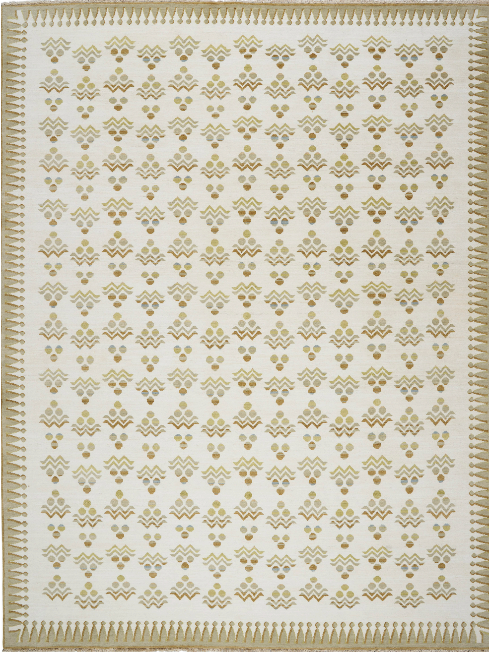
9' X 12' RUG SHOWN