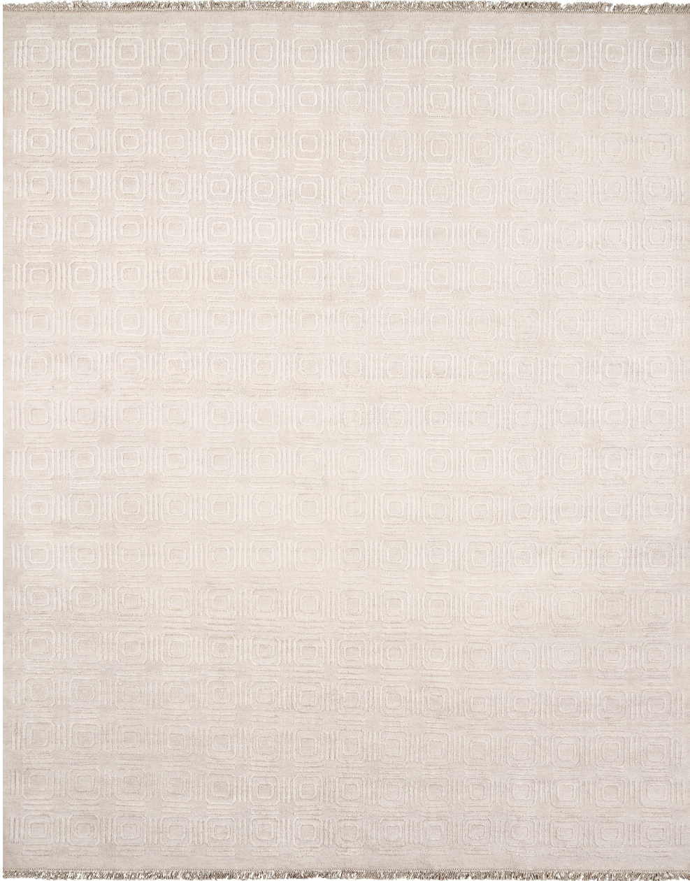
8' X 10' RUG SHOWN

COLOR: IVORY FIBER: SILK & COTTON GROUP# 517