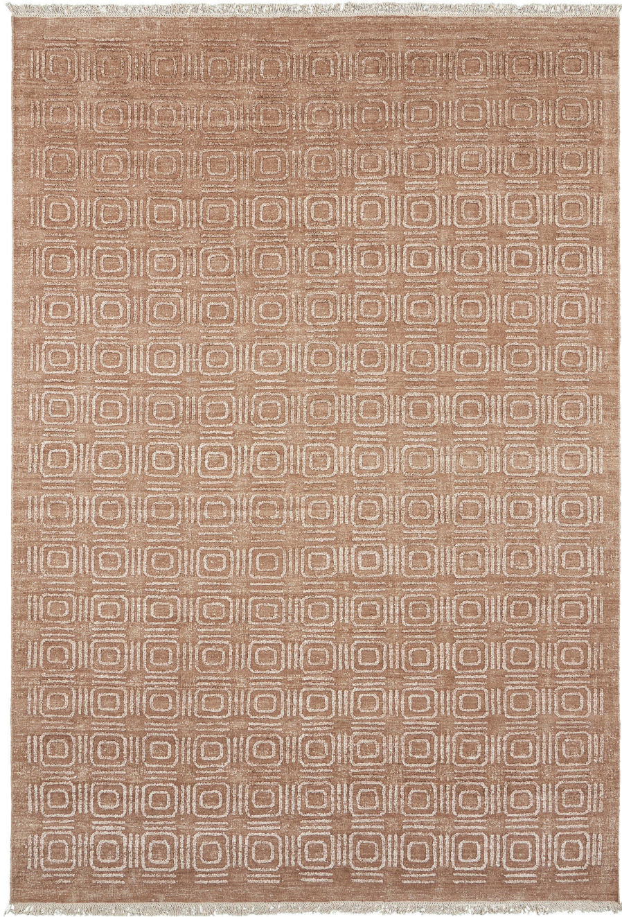
6' X 9' RUG SHOWN

COLOR: CARAMEL FIBER: SILK & COTTON GROUP# 517