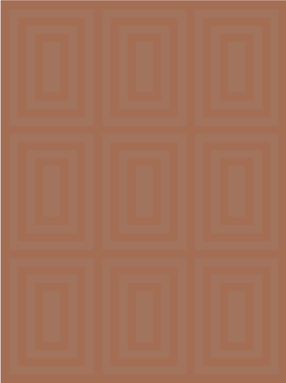
9' X 12' ARTWORK SHOWN