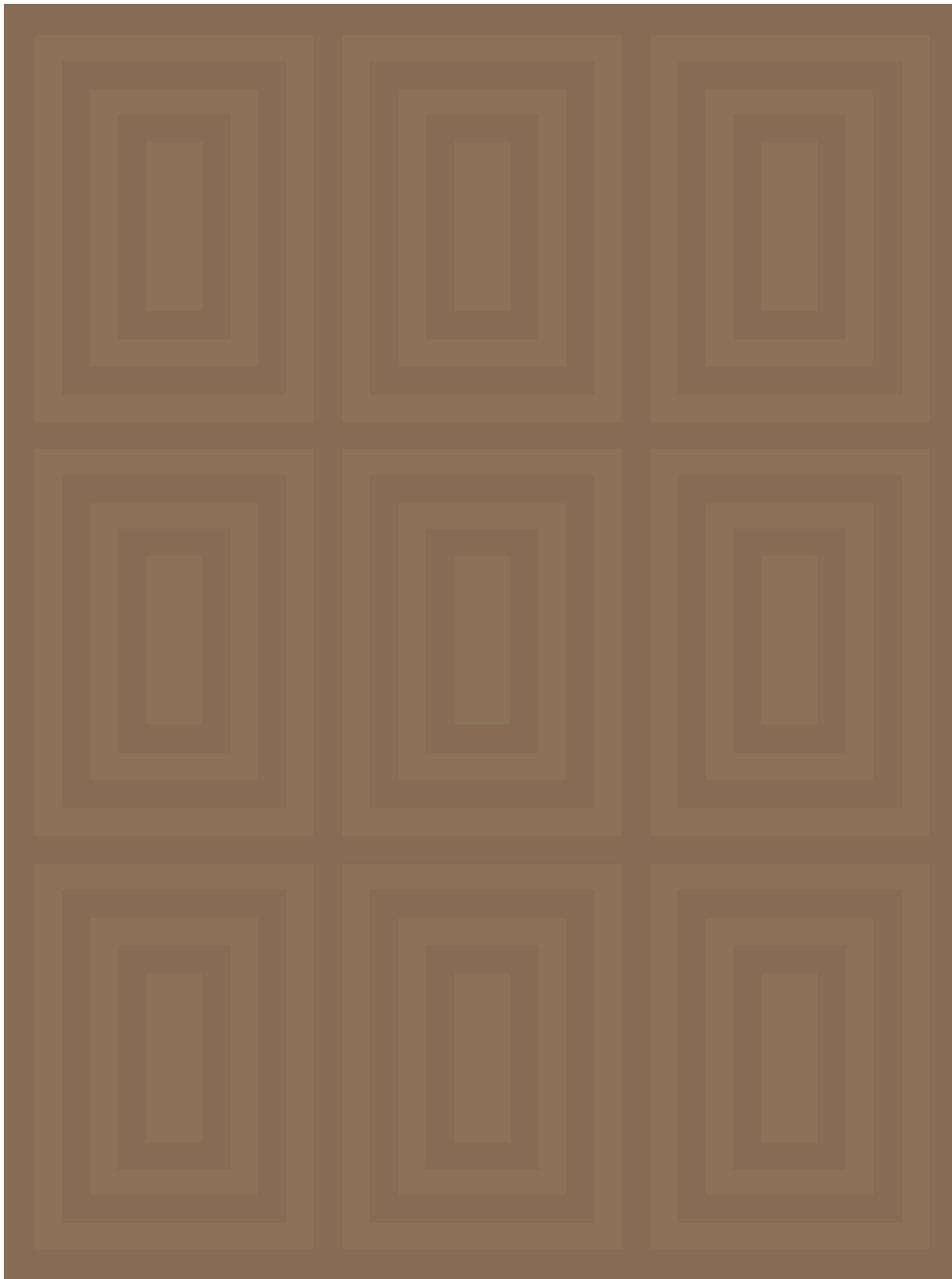
9' X 12' ARTWORK SHOWN