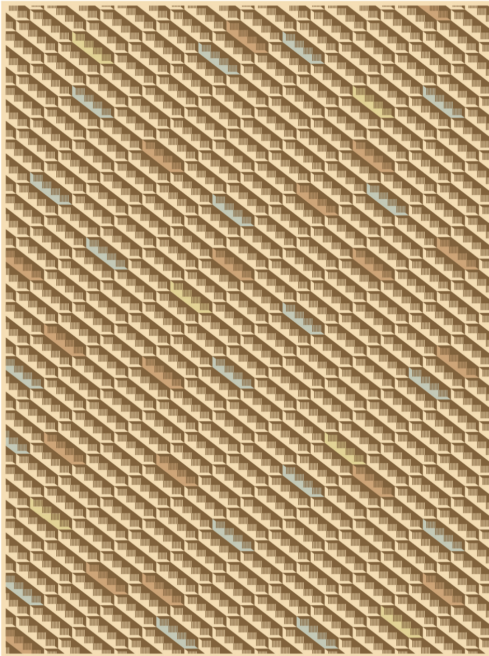
ARTWORK FOR 9' X 12' RUG SHOWN

COLOR: SOFT MULTI FIBER: WOOL GROUP# 517