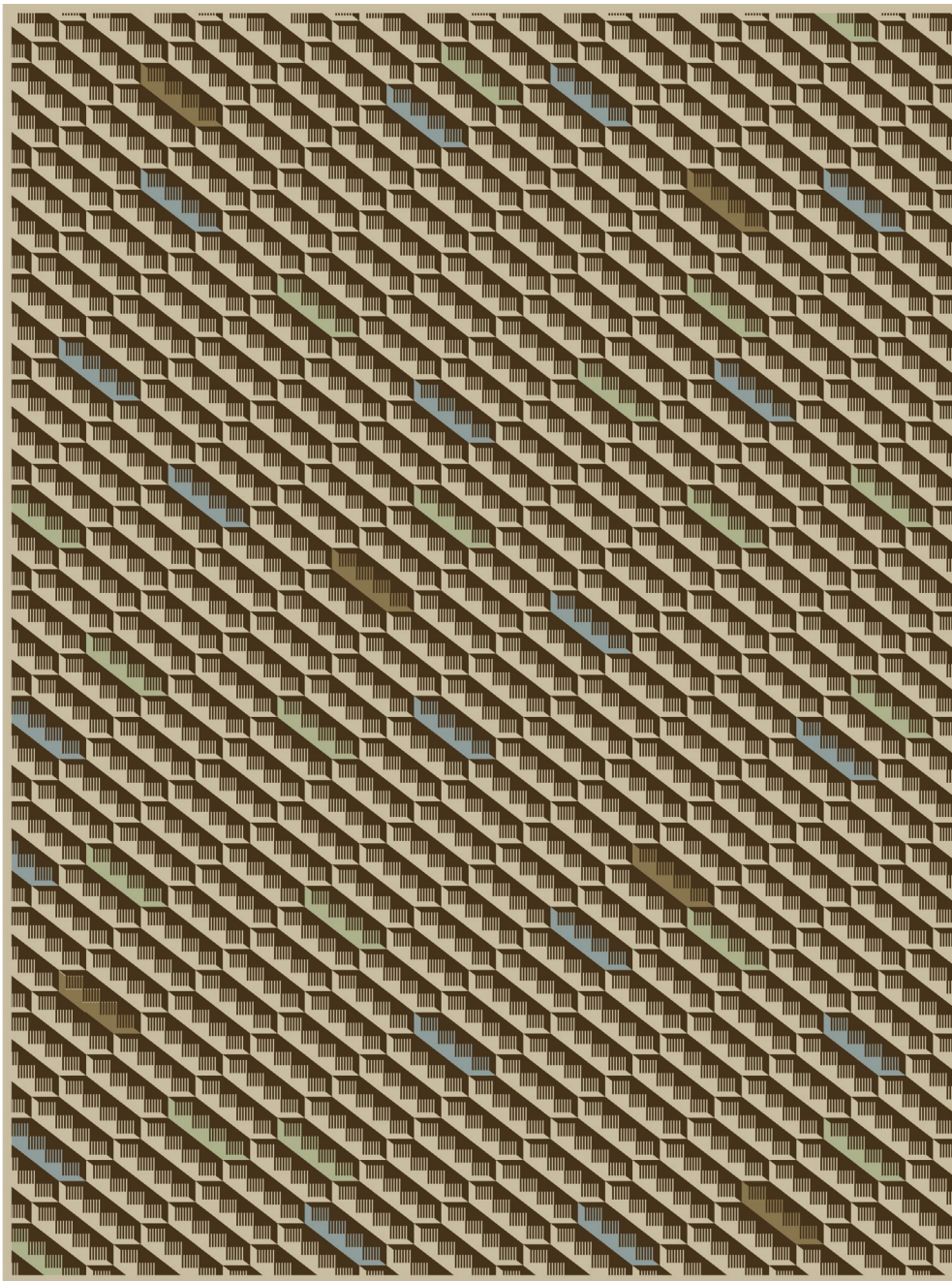
ARTWORK FOR 9' X 12' RUG SHOWN

COLOR: BROWN MULTI FIBER: WOOL GROUP# 517