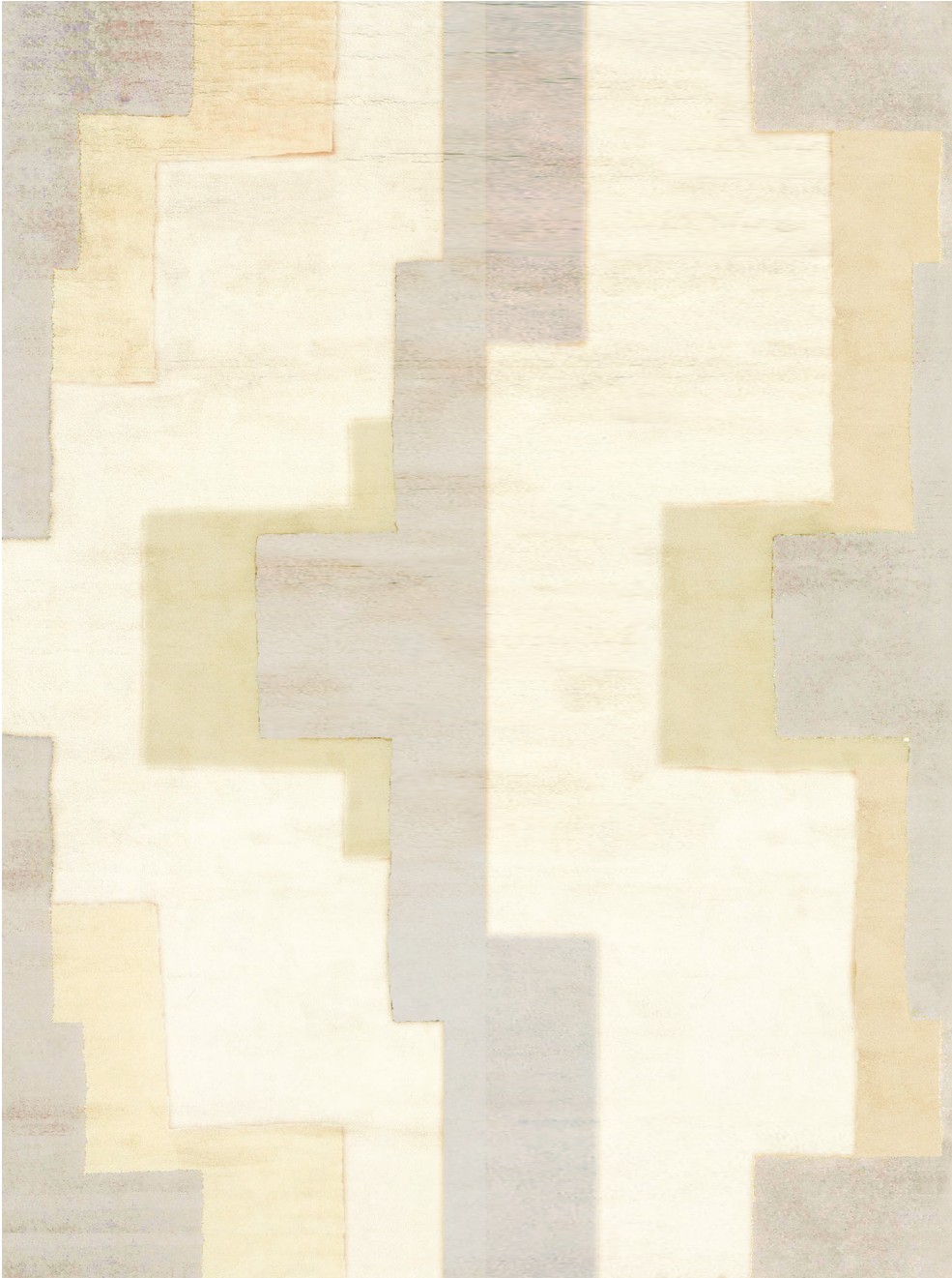
ARTWORK FOR 9' X 12' RUG SHOWN

COLOR: IVORY FIBER: SILK & WOOL GROUP# 1062