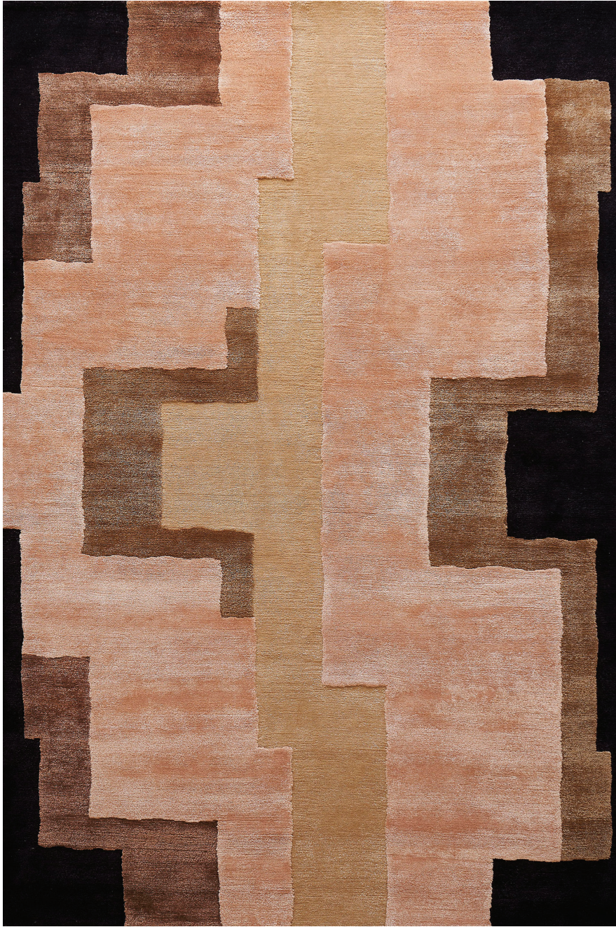
6' X 9' RUG SHOWN

COLOR: DESERT ROSE FIBER: SILK & WOOL GROUP# 1062