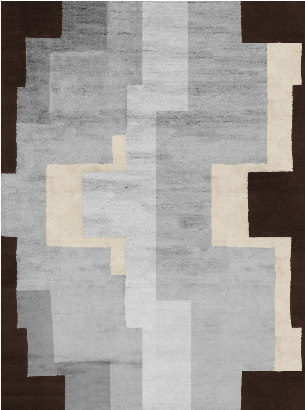
ARTWORK FOR 9' X 12' RUG SHOWN

COLOR: FOG FIBER: SILK & WOOL GROUP# 1062