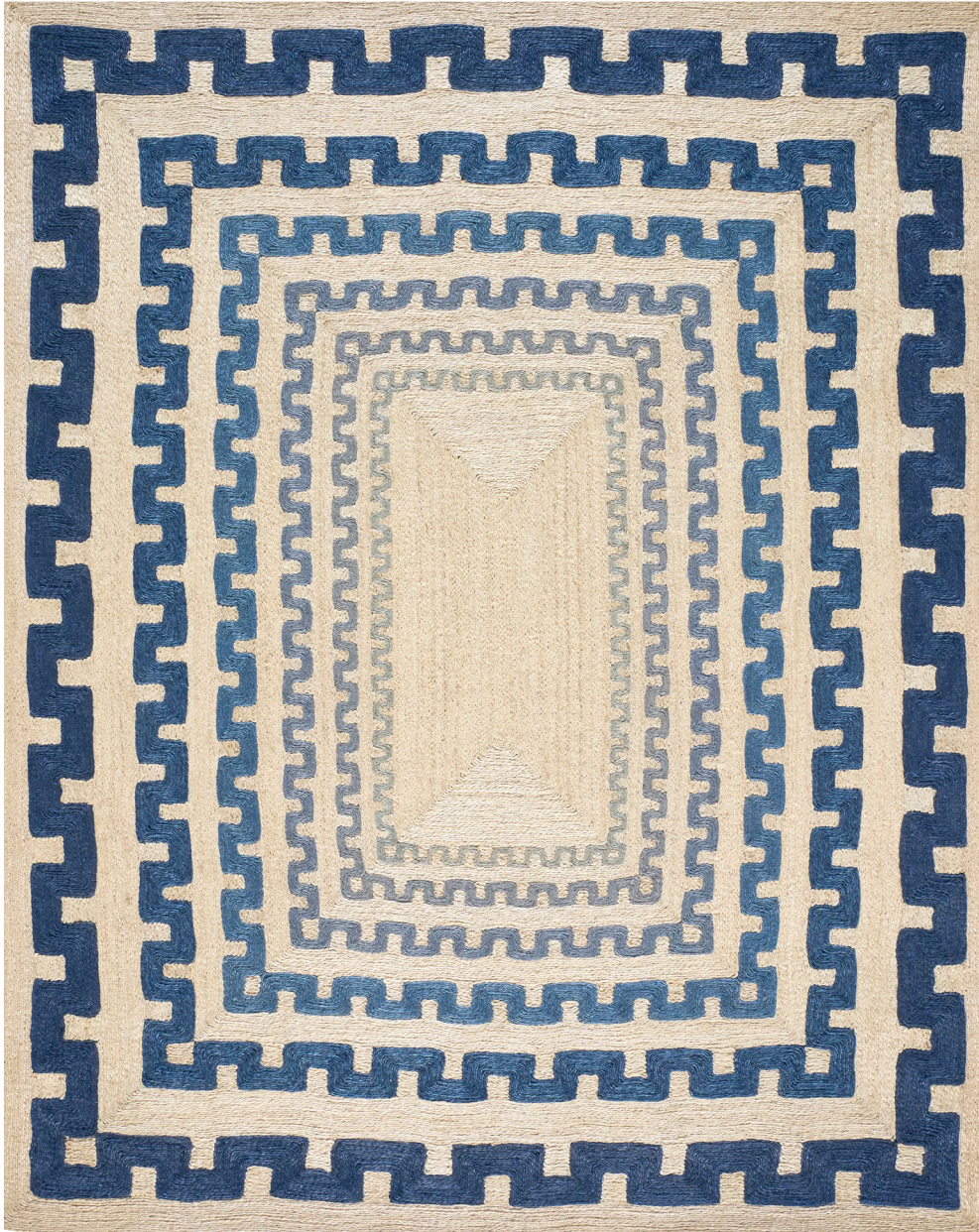
8' X 10' RUG SHOWN