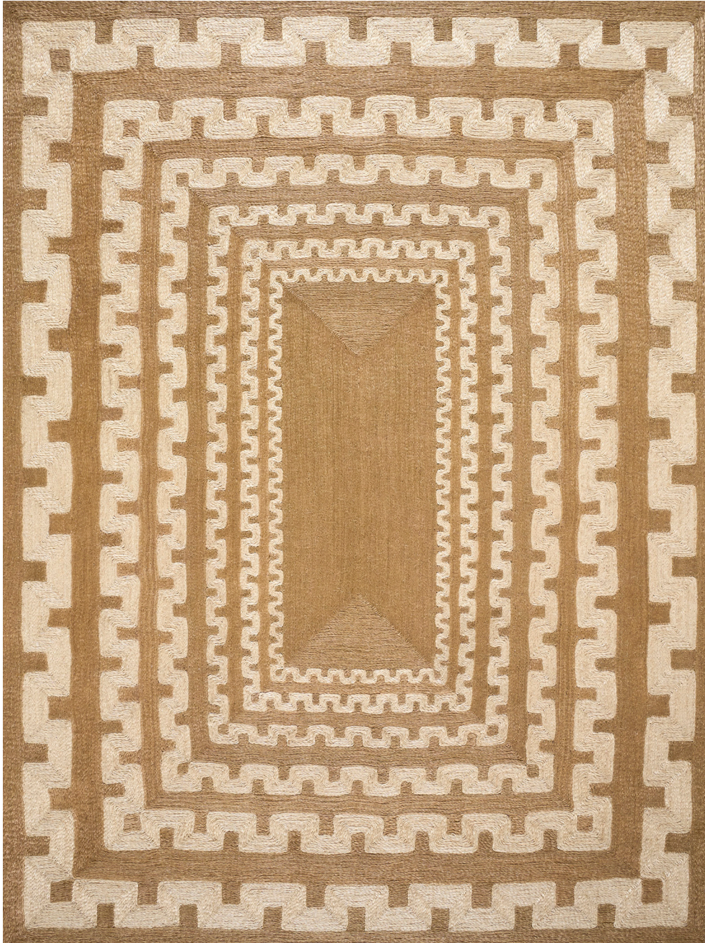
9' X 12' RUG SHOWN