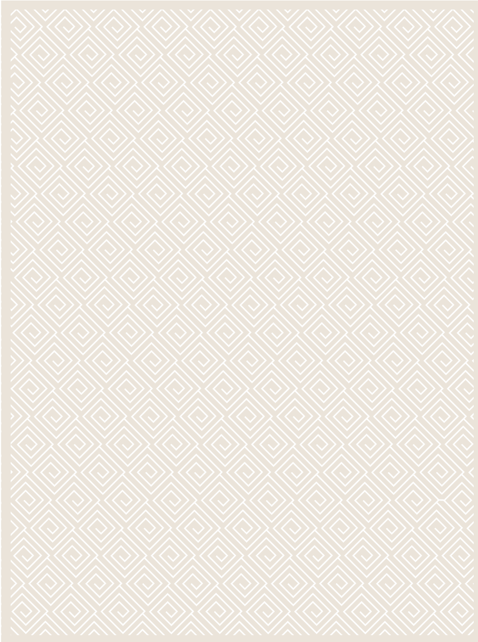
ARTWORK FOR 9' X 12' RUG SHOWN