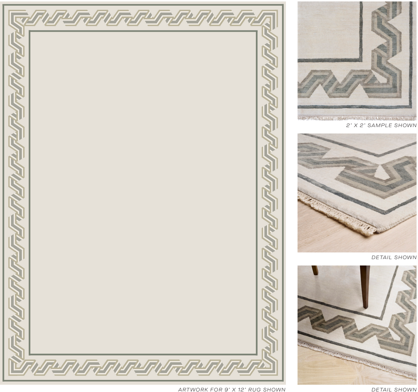
ARTWORK FOR 9' X 12' RUG SHOWN

COLOR: CELADON FIBER: WOOL & SILK GROUP# 1194