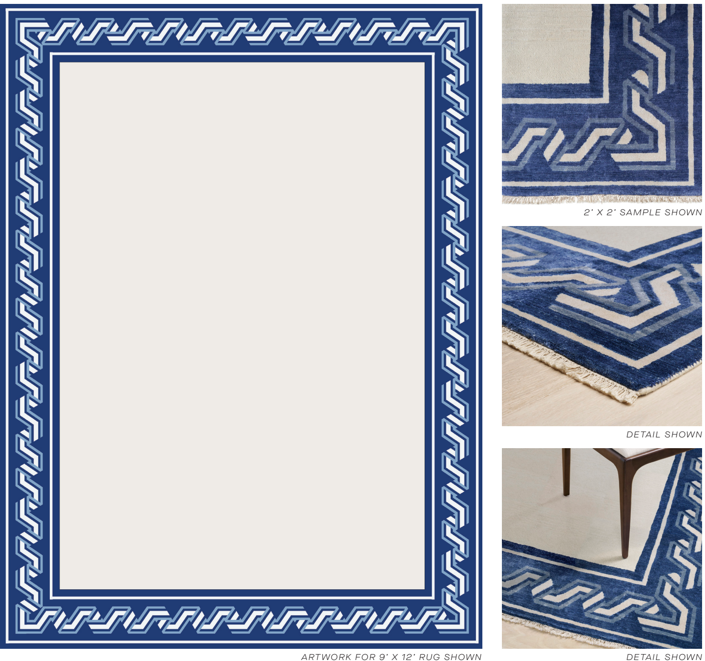
ARTWORK FOR 9' X 12' RUG SHOWN

COLOR: ZENITH BLUE FIBER: WOOL & SILK GROUP# 1194