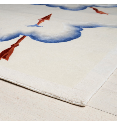
ACTUAL 9' X 12' RUG SHOWN DETAIL SHOWN