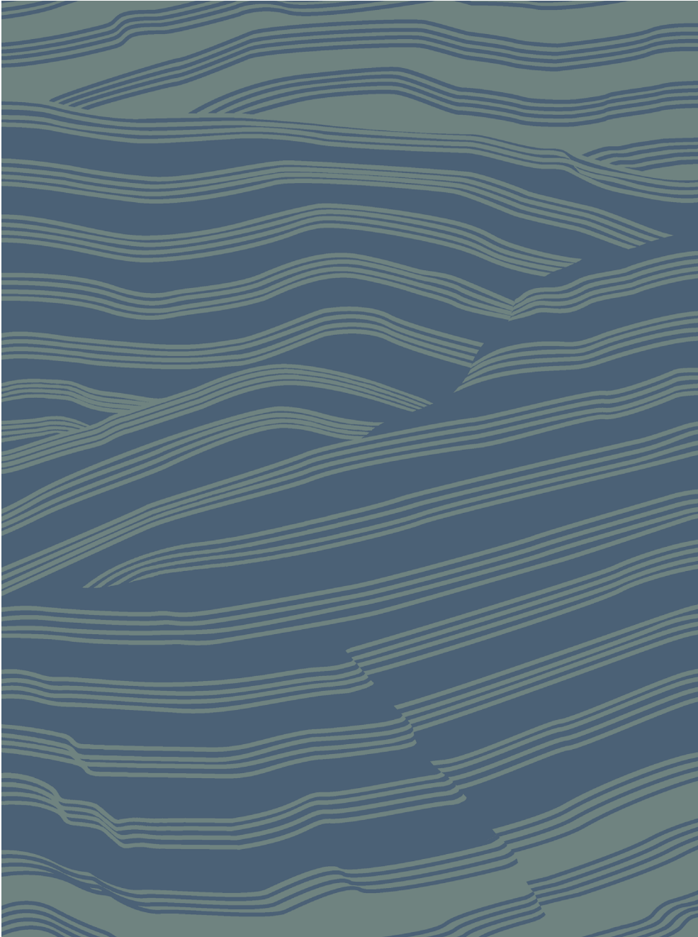
ARTWORK FOR 9' X 12' RUG SHOWN