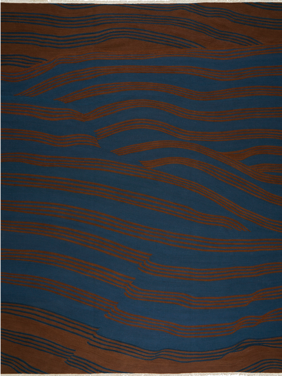
9' X 12' RUG SHOWN

COLOR: UMBER & INDIGO FIBER: WOOL GROUP# 1188