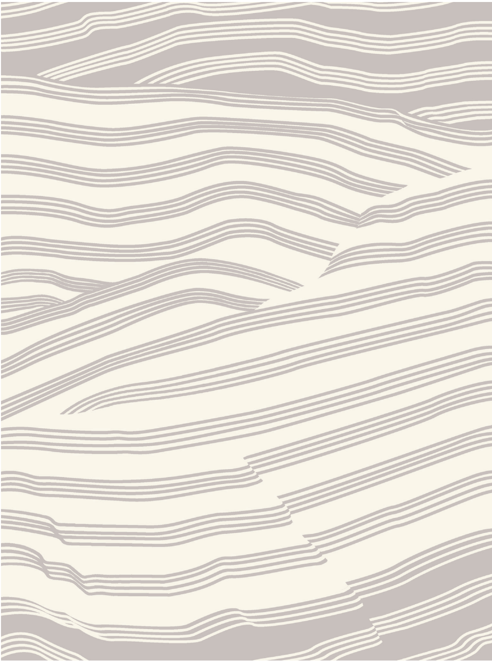
ARTWORK FOR 9' X 12' RUG SHOWN