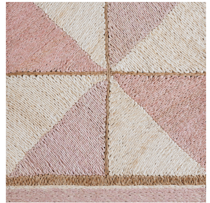
2' X 2' SAMPLE SHOWN