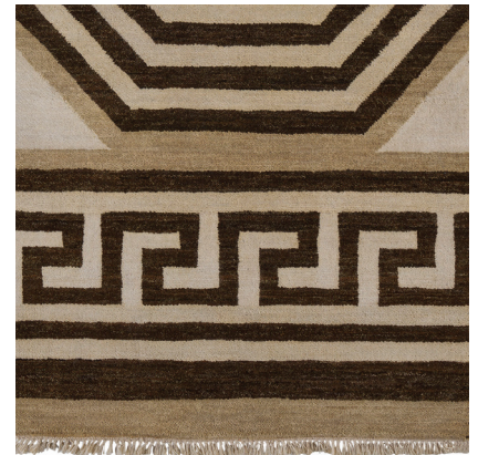
2' X 2' SAMPLE SHOWN