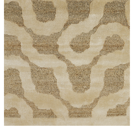
2' X 2' SAMPLE SHOWN