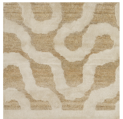
2' X 2' SAMPLE SHOWN