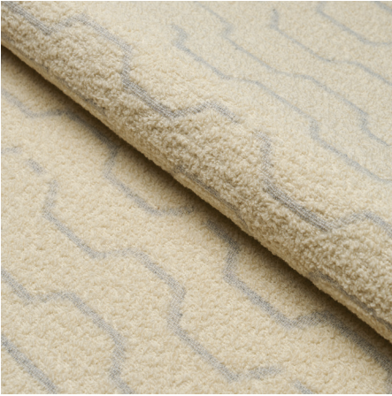
PATEK WOOL BOUCLÉ IVORY 83932 FABRIC

Inspired by one of Patterson Flynn's most popular carpet designs, Patek Wool Bouclé derives its elegant, articulated stripe from Tibetan tiger motifs. Made of 100% worsted wool that is spun, dyed and woven on a jacquard loom in Scotland, this abstract geometric is made of chunky yarns that create a nubby texture and soft, heathered stripes. Cozy and cossetting, this versatile, medium scale upholstery fabric is perfect for a headboard, sofa or pillows.