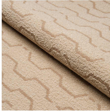
PATEK WOOL BOUCLÉ SAND 83931 FABRIC