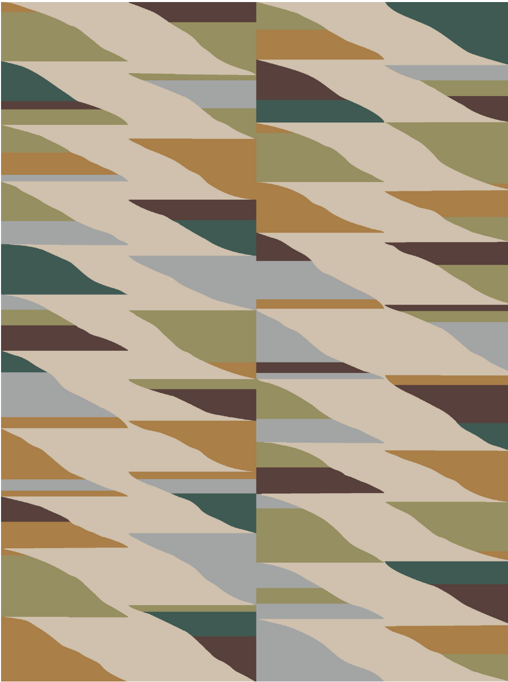
9' X 12' ARTWORK SHOWN

COLOR: GREEN MULTI FIBER: WOOL GROUP# 1188