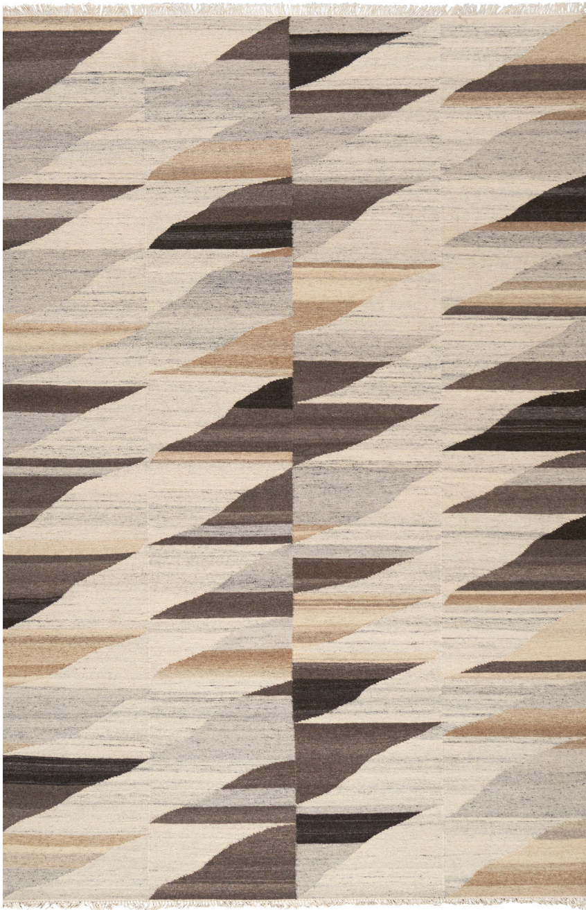
6' X 9' RUG SHOWN