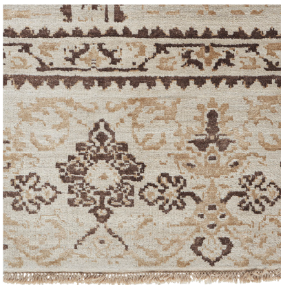
2' X 2' SAMPLE SHOWN