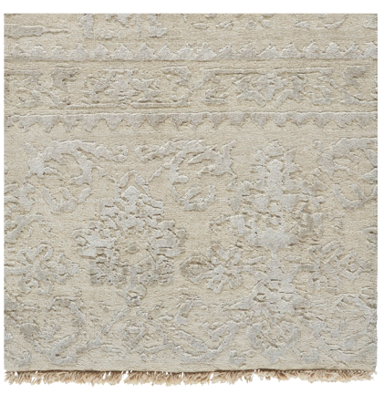
2' X 2' SAMPLE SHOWN