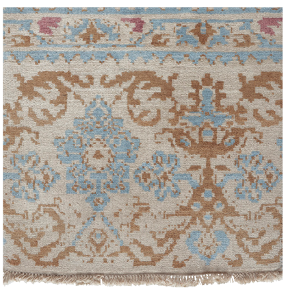
2' X 2' SAMPLE SHOWN