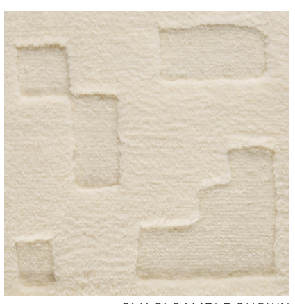
2' X 2' SAMPLE SHOWN