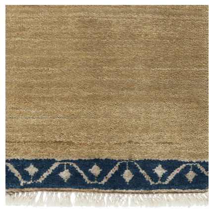
2' X 2' SAMPLE SHOWN