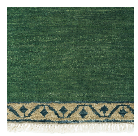
2' X 2' SAMPLE SHOWN