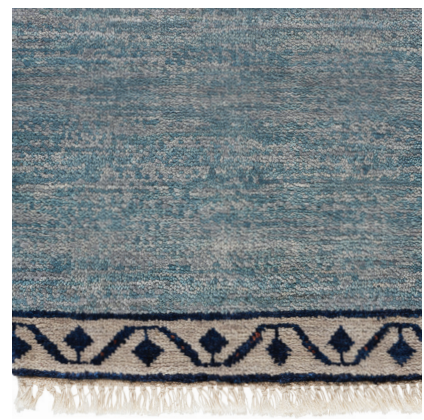
2' X 2' SAMPLE SHOWN