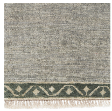
2' X 2' SAMPLE SHOWN